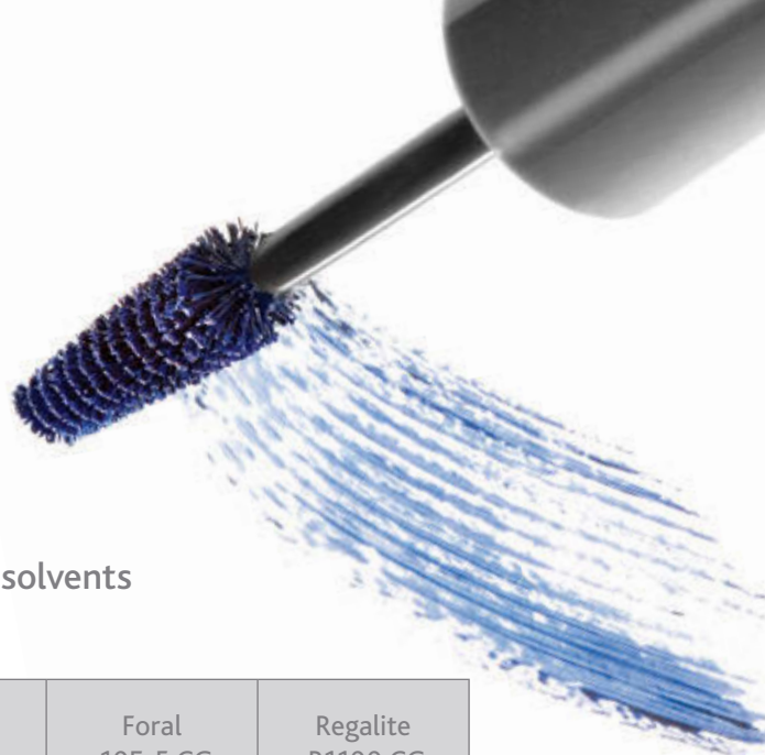
Table 3 Solubility a of Eastman resins in various cosmetic solvents (1:9 resin:solvent)

As shown in Table 3, Eastman cosmetic resins are soluble in a variety of solvents. Each resin was combined with the solvent (1:9 parts-by-weight resin to solvent) and gently agitated for one week at room temperature. Resins are likely to disperse quicker and more completely at higher temperatures.